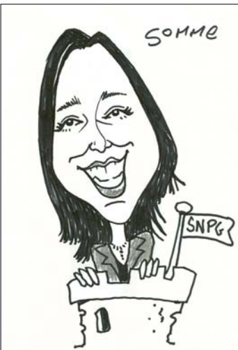
Caricature of me from the artist of Fizzers. Their exhibition will be at the Scottish National Portrait Gallery until July. Entrance £2.