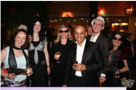
Fun and games with the Friday night Fancy dress party "Looking to the Future"