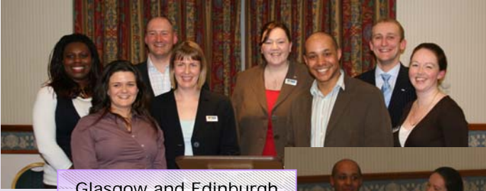
Glasgow and Edinburgh Debate Teams