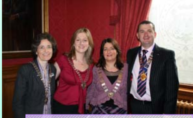
Civic Lunch in Aberdeen

Nine members from Edinburgh made their way up to Aberdeen for the JCI Scotland National Conference. Great friendships were made, fun and laughter was had by all and development was gained through fantastic key note speakers and training.